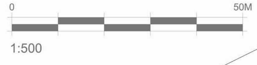
Proposed Site Layout Y81.781.03 1:500 @ A1 16th December 2011

Energy Saving - High levels of insulation to be provided - High levels of air tightness to be achieved - Sustainable technologies to be provided where appropriate